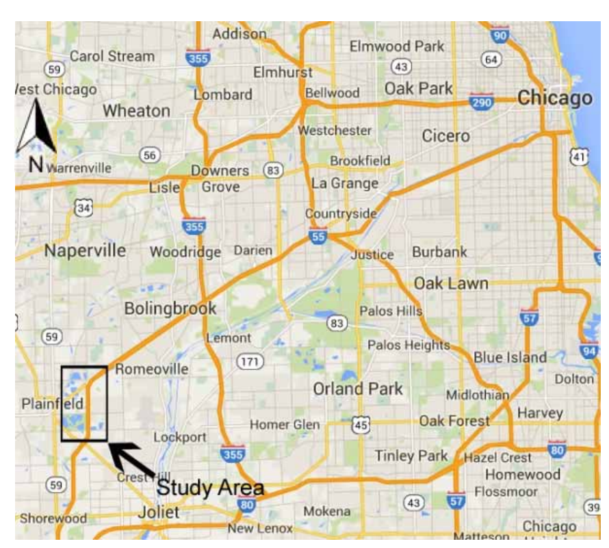
Figure 1: Regional Map

Interstate 55 (I-55) is a northsouth interstate freeway linking Chicago with the southwest suburbs and Illinois downstate as illustrated in Figure 1. Ιt serves as a life line between the Chicago Metropolitan Area and Will County. regional route that connects to other northeastern Illinois interstate highways including I-355, I-294, I-94 and I-90 to the northeast and I-80 to the south. South of the Chicago area, I-55 travels through Illinois to the St. Missouri metropolitan area and eventually ends in New Orleans, Louisiana. I-55 is part of the National Highway