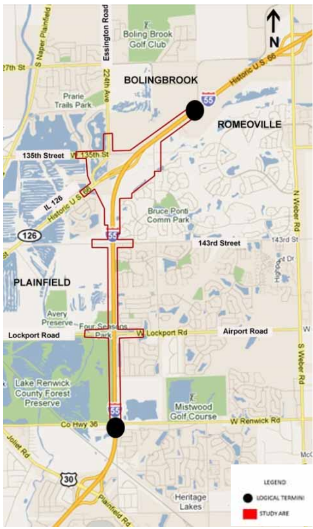
Figure 2: Study Area

entering and exiting the freeway. Three crossroads within the study area that have been identified as potential interchange locations are IL 126, 143rd Street/Taylor Road, and Airport Road/Lockport Street. Figure 2 illustrates the study area limits for this project and the location of the three crossroads. Figure 3 shows the land uses along I-55 and the spacing interval between the three crossroads and the adjacent interchanges.