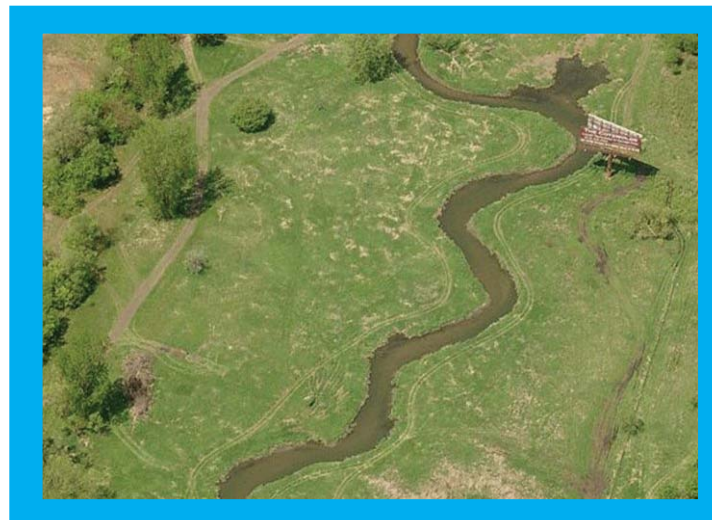
LILY CACHE SLOUGH